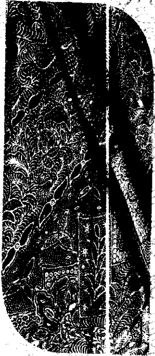
Batik Solo, Surakarta