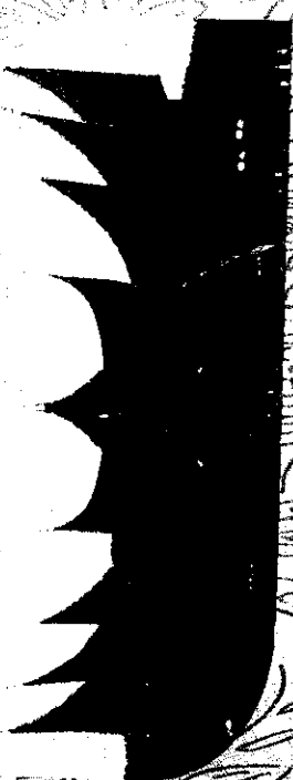
Gadang House, West Sumatra