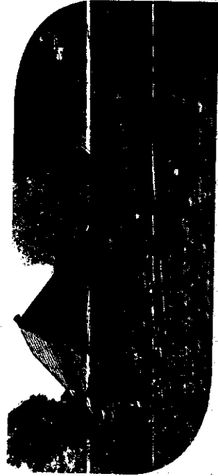
Kasepuhan Palace, Cirebon