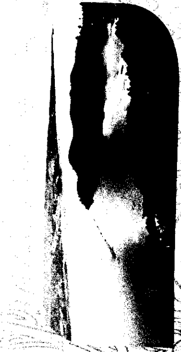
Lake Toba, North Sumatra

For further information please visit : www.darmasiswa.kemdikbud.go.id